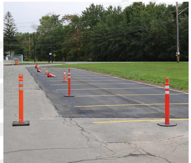
Expanded parking in JSHS front lot

Benjamin Cosor Elementary School will see upgrades to their recreational areas by the start of the school year. The two playgrounds will be replaced with brand new equipment, benches, and trash bins.