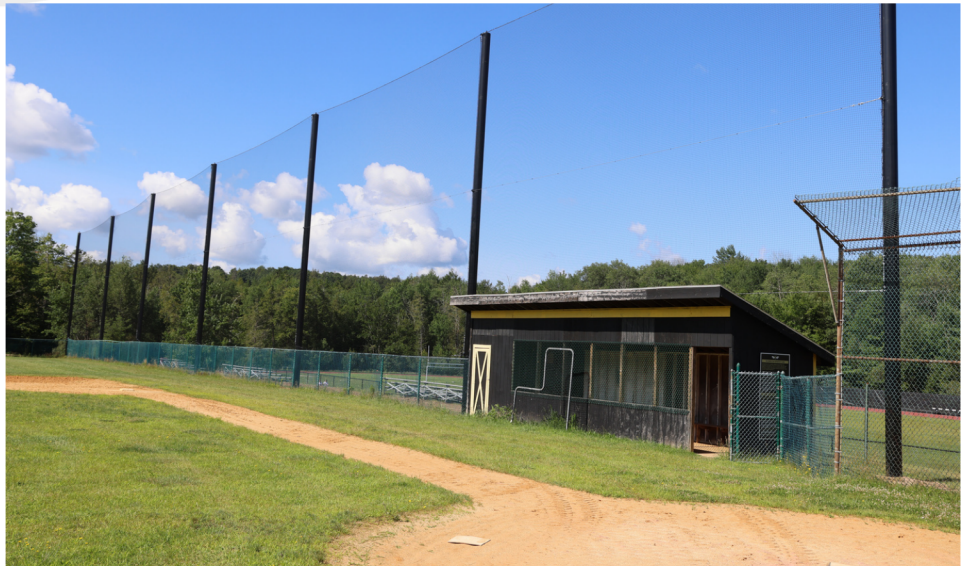
Safety netting along first base line

Restoration has begun at the softball field, located at the Benjamin Cosor Elementary School. Existing material has been removed from the infield and replaced with six inches of new sand and material. A new drainage system will also be installed; running from the left field fence to the backstop. Continued on next page